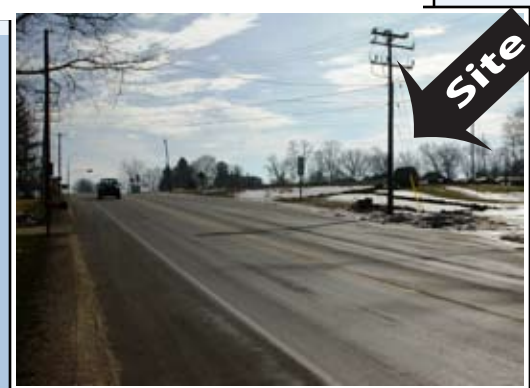
CR D East Bound