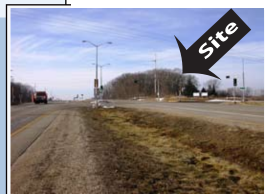
Hwy. 36 South Bound